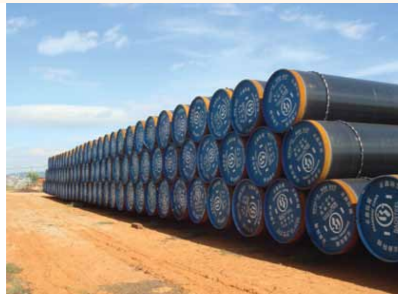
宝钢UOE焊管成功应用于西气东输二线工程